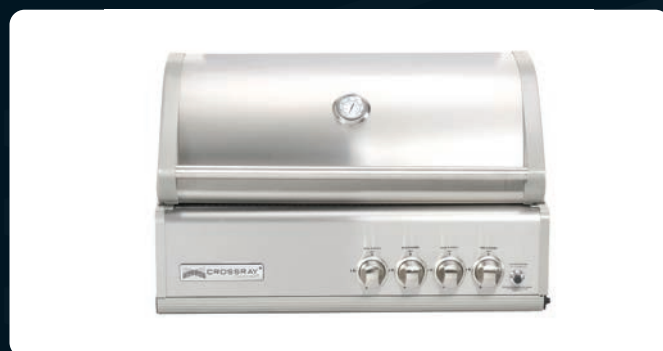
4 burner In-Built BBQ Model TCS4FL