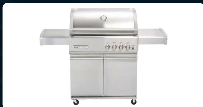
4 burner Trolley BBQ Model TCS4PL

The Range All CROSSRAY BBQ's come with grill plates as standard